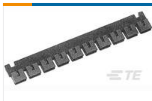
TE Part #382575-3 2MM MINI-SHUNT ASSEMBLY 30 AU