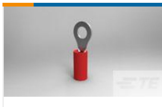
TE Part #2-31890-1 PIDG R 22-16 COMM 22-18 MIL 8