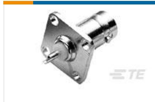
TE Part #1-1337446-0 BNC Pnl Skt 50Ohm Silver Pltd