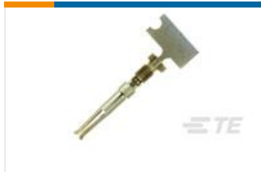
TE Part #7-66504-0 20 DF SOCKET CONT,SMALL PACK