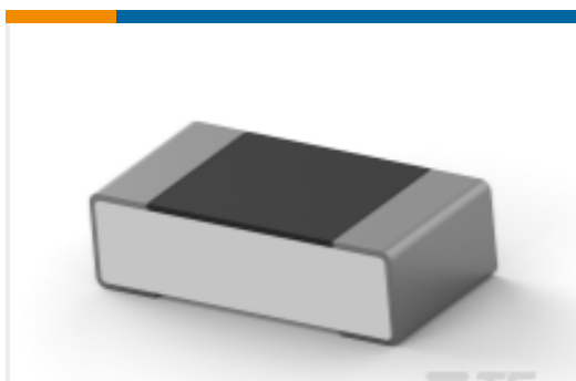
TE Part #5-2176369-2 RQ 0603 137R 0.1% 10PPM 5K RL