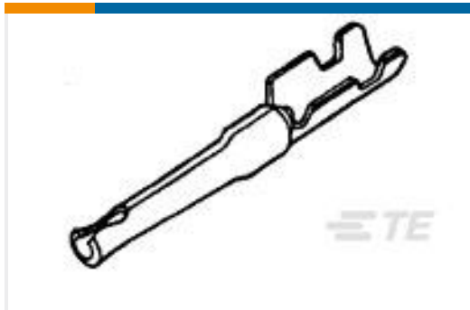
TE Part #1658686-1 SOCKET CONTACT,22 DF,STRIP,22-