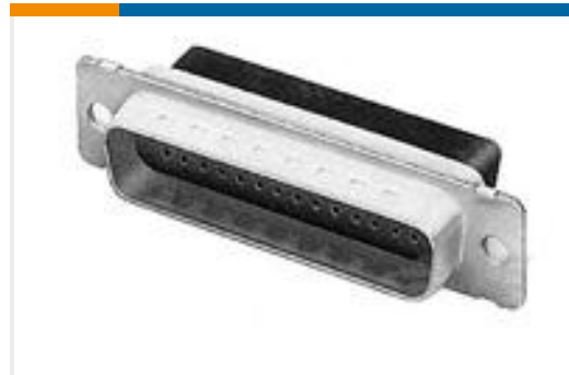
TE Part #1658672-1 HDP-22,PLUG,SIZE 3,44 POSN