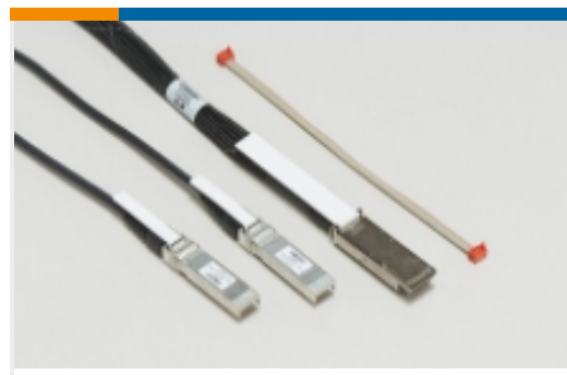
Pluggable I/O Cable Assemblies(52)