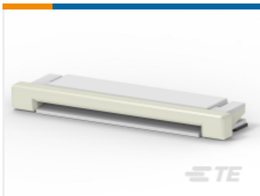
TE Part #1734742-6 0.5mm FPC Connectors