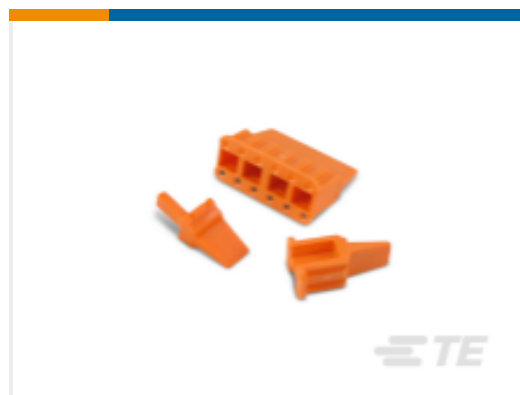
TE Part #WM-2PA DEUTSCH DTM WEDGELOCKS