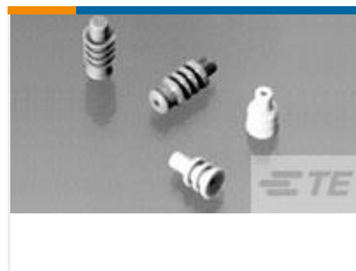
TE Part #178210-1 NEW RUBBER PLUG SMALL WIRE