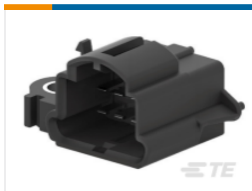
TE Part #1-963224-1 LOW & MEDIUM POWER HEADER