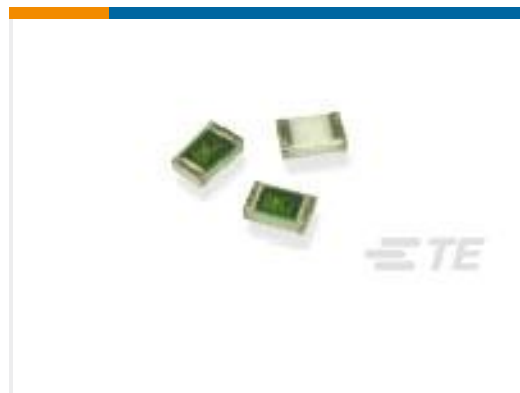
TE Part #1676153-3 RN 0805 10K 0.1% 10PPM 5KRL