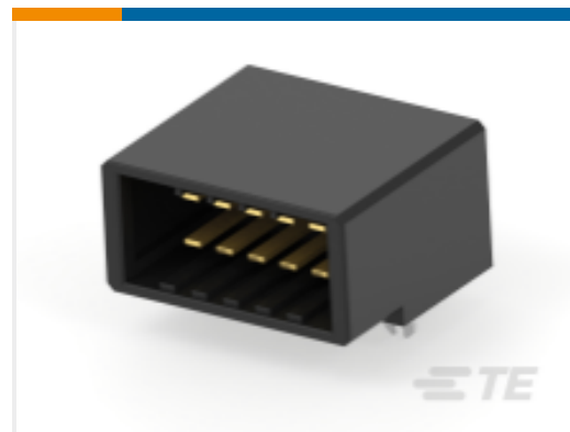
TE Part #1-178295-2 DYNAMIC 3100 HDR ASSY