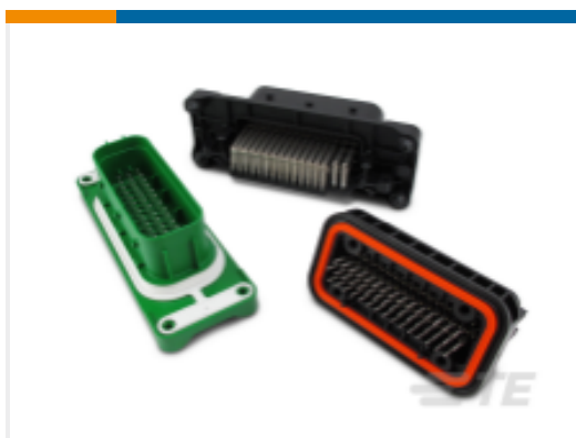
TE Part #1-1452228-9 LEAVYSEAL HEADERS