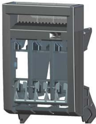
ACCES.F.FUSE SWI. DISCONNECTOR FOR NH00 FUSE CARRIER