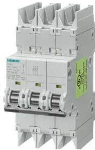
CIRCUIT BREAKER 10KA, 3POLE, C, 1.6A ACC. TO UL 489 - 480Y/277V