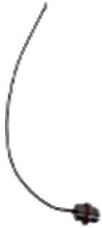
N B/H Jack \Phi 1.37 U.FL R/A Plug, Black, 50 \Omega , L=300,MM