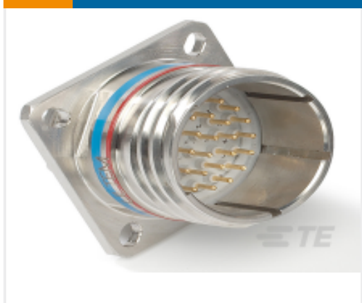
TE Part # YDTS20Z25-24BNV001 RECP ASSY