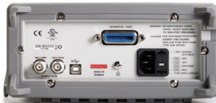
Model 2110 rear panel.

INPUT BIAS CURRENT: <30pA at 25°C. INPUT PROTECTION: 1000V all ranges (2W input). AC CMRR: 70dB (for 1kΩ unbalance LO lead). POWER SUPPLY: 100V/120V/220V/240V. POWER LINE FREQUENCY: 50/60Hz auto detected. POWER CONSUMPTION: 25VA max. DIGITAL I/O INTERFACE: USB-compatible Type B connection, GPIB (option). ENVIRONMENT: For indoor use only. OPERATING TEMPERATURE: 0° to 40°C. OPERATING HUMIDITY: Maximum relative humidity 80% for temperature up to 31°C. STORAGE TEMPERATURE: –40° to 70°C. OPERATING ALTITUDE UP TO 2000 M ABOVE SEA LEVEL. BENCH DIMENSIONS (WITH HANDLES AND BUMPERS): 107 mm high × 252.8 mm wide × 305 mm deep (3.49 in. × 9.95 in. × 12.00 in.). WEIGHT: 2.23 kg (4.92 lbs.). SAFETY: Conforms to European Union Low Voltage Directive, EN61010-1. Measurement Cat I 1000V and CAT II 600V. EMC: Conforms to European Union Directive 89/336/EEC, EN61326-1. WARRANTY: One year.