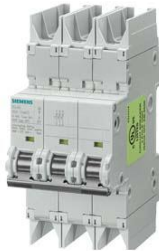
CIRCUIT BREAKER 10KA, 3POLE, C, 0.5A ACC. TO UL 489 - 480Y/277V