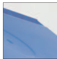
Sturdy form design

Product information table for accessories see page 13