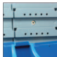
Wall mounting bracket ProfiPlus Endless