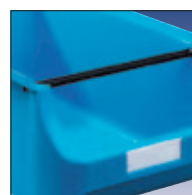
Label & carrying rod