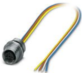
Flush-type connector, Universal, 4-position, Socket, straight, M12-Push-Pull, D-coded, Front mounting, M16 x 1.5, Individual wires, cable length: 0.5 m

Please be informed that the data shown in this PDF Document is generated from our Online Catalog. Please find the complete data in the user's documentation. Our General Terms of Use for Downloads are valid ( http://phoenixcontact.com/download )