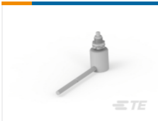
TE Part #K1152919 Limit switch G12-421-M-18