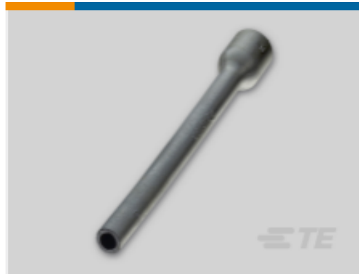
TE Part #138518-000 202F274-51-10/164-0