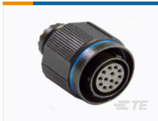
TE Part #ZPF000000000167336 DTS 26 B 23-21 PN