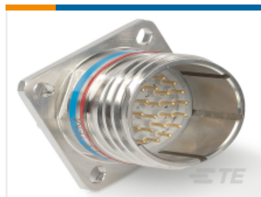
TE Part # CAT-D38999-DTS9E D38999: Square Flange, 23-55 insert