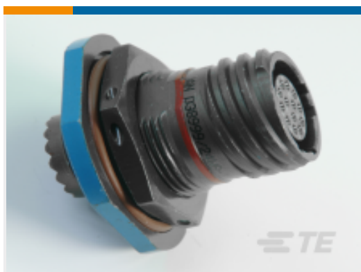
TE Part # CAT-D38999-DTS17T Jam Nut: D38999, 23-55 Insert, Black Zinc Nickel Plating