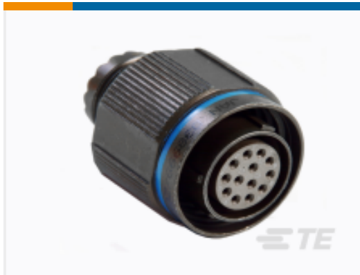
TE Part #YDTS26Z23-21PNV001 PLUG ASSY