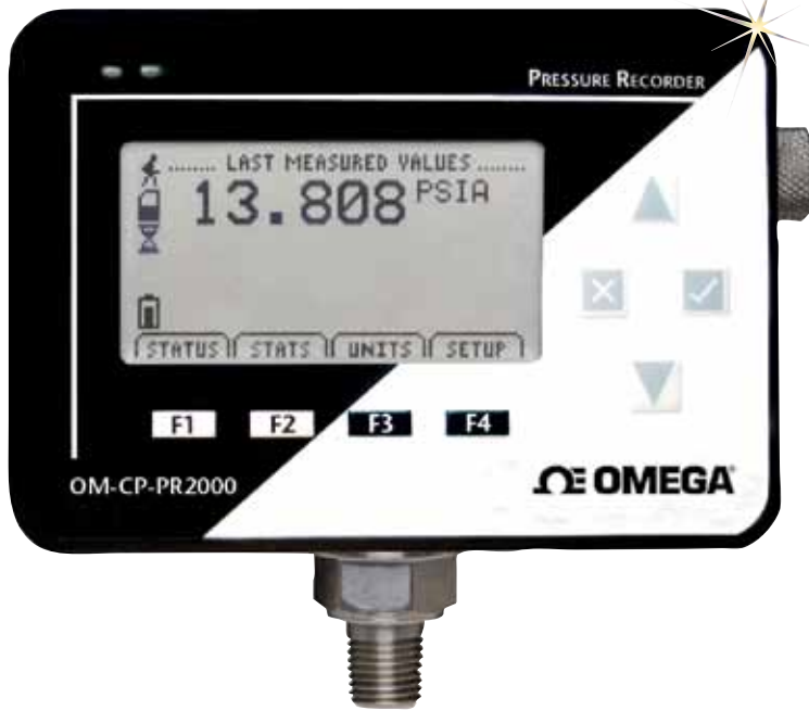
OM-CP-PR2000-30-A, data logger shown larger than actual size