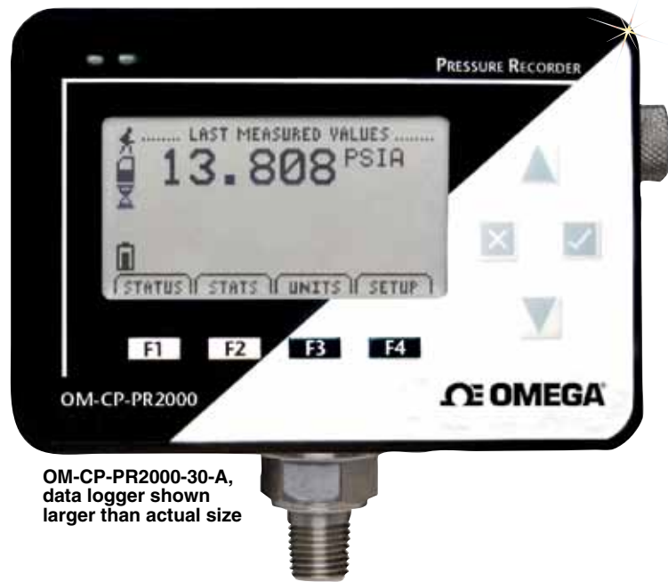
OM-CP-PR2000-30-A, data logger shown larger than actual size

NIST traceable calibration is available for users needing to meet regulatory requirements. Creating permanent records, performing data calculations, and the graphing of data is quick and easy: Simply connect the interface cable to an available USB or serial port and, with a few clicks of the mouse, data is downloaded and ready for review or export to Excel.