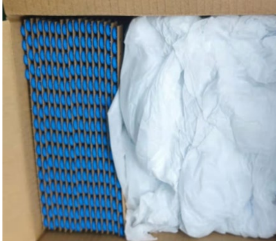
Pic 1: Previous packaging (example)