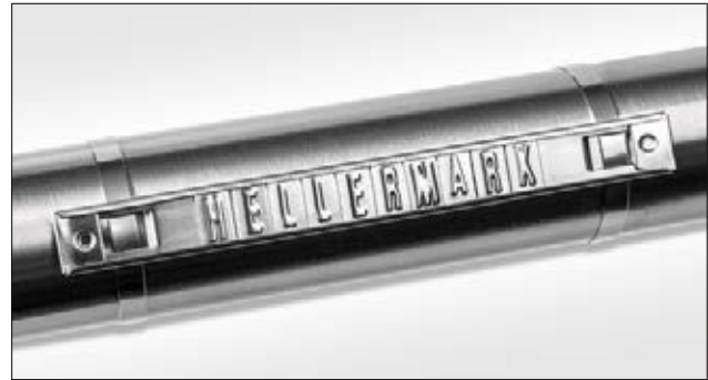
Hellermark SSC and SSM.