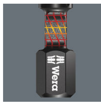
Torsion zone specially designed to absorb such forces and thereby protect the bit tip.