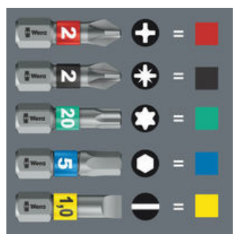
"Take it easy" tool finder with colour coding according to profiles and size stamp – for simple and rapid accessing of the required tool.