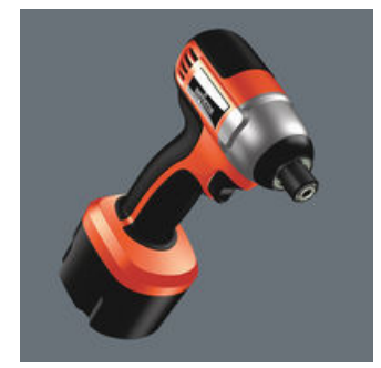
For use with impact screwdrivers. Improve productivity when screwdriving with power tools.