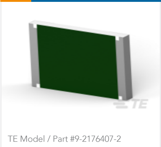
3560 56R 5%