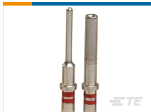
TE Part #ZPF000000000001261 097-0267-16 A1267