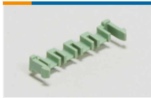
PCB Latches, Locks & Retainers(2)