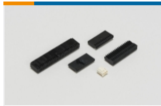
Wire-to-Board Connector Assemblies & Housings(5)