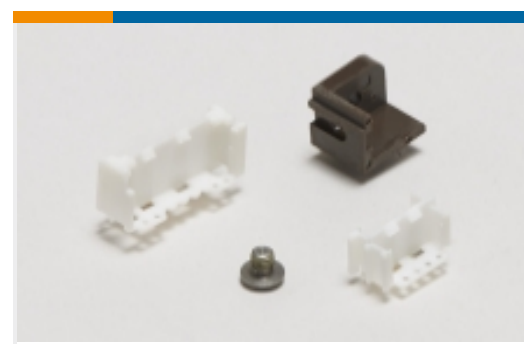
PCB Connector Mounting(1)