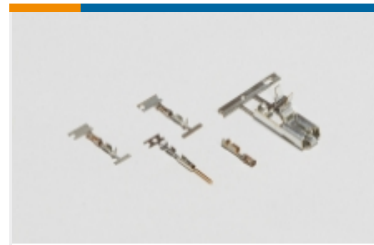
Wire-to-Board Connector Contacts(66)