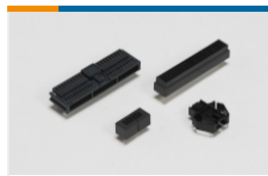
PCB Connector Shrouds(1)