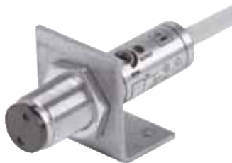
Sensor fitted inside the mounting aid

Using the mounting aid cylindrical sensors are fast and easy to fit. Use the nuts included with the sensor for attachment.