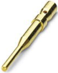
Crimp contact, turned, contact diameter: 1 mm, crimp range: 0.5 mm 2 ... 1 mm 2

Please be informed that the data shown in this PDF Document is generated from our Online Catalog. Please find the complete data in the user's documentation. Our General Terms of Use for Downloads are valid ( http://phoenixcontact.com/download )