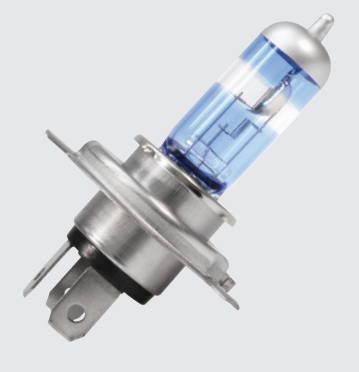
LightBooster + 120 Up to 120% brighter upgrade