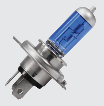
Light Booster Rally Powerful 100w off-road beam