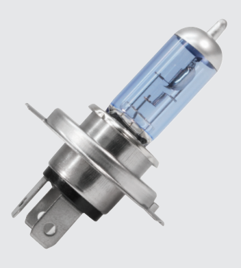
Light Booster Blue Stylish blue tint for a HID look