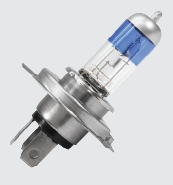
LightBooster +90 Up to 90% brighter upgrade