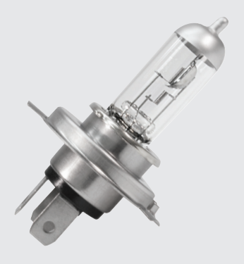
LightBooster +50 Up to 50% brighter upgrade