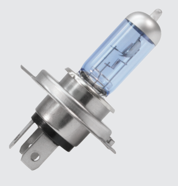
LightBooster Blue+ Up to 50% brighter with a blue tint