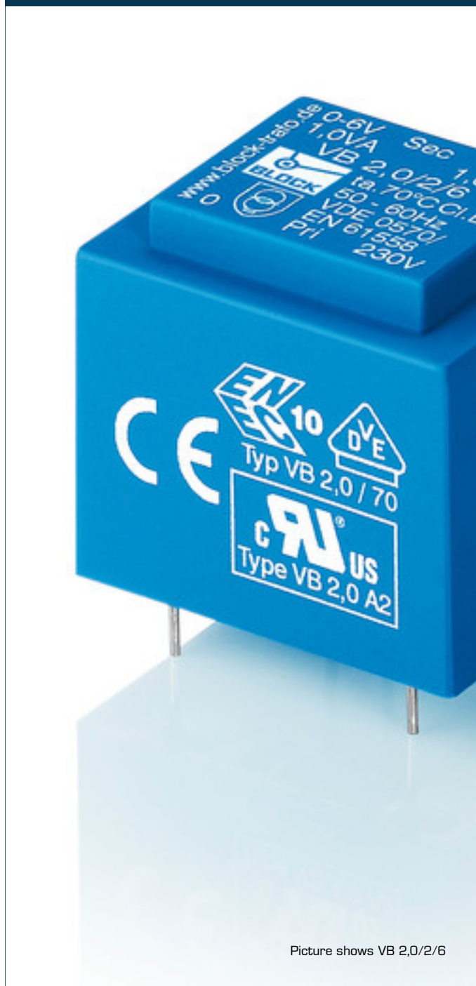
Picture shows VB 2,0/2/6