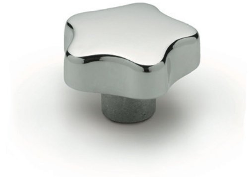
ELESA Original design

H7 reamed blind hole or threaded blind hole.