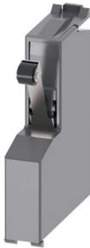
POSITION SIGNALING SWITCH FOR ACCESSORY FOR: PLUG-IN -OUT AND DRAW-OUT UNIT