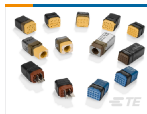
TE Part #ZPF000000000015141 DMC-M 01-08 AB