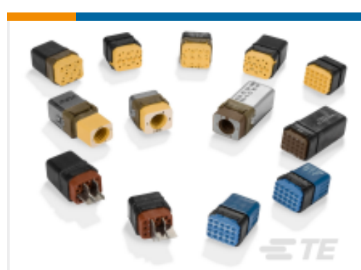
TE Part #ZPF000000000203708 DMC-M 99-10 PC