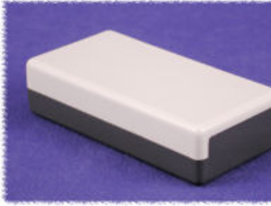
Assembled View (Top)