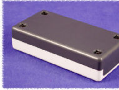
Assembled View (Bottom)