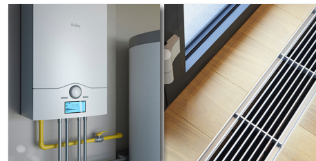
Water heater automation Floor heating automation