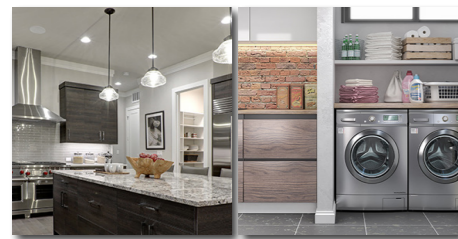
Lights control Laundry machine monitoring