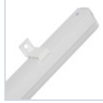
424020004 GR ACCESSORY RGL LEDECO