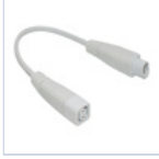
424020003 CONNECTION PLUG 150 RGL LEDECO