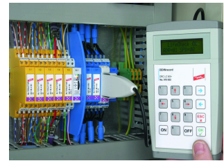
Snap-on LifeCheck sensor

Portable device with LifeCheck sensor for flexible use. Fast and easy testing of LifeCheck-equipped arresters. Visual and acoustic indication. With additional USB connection and database software for PC-aided management of test samples and documentation of the test results. DRC LC M3+ features a snap-on LifeCheck sensor. The hand-held device allows parameterisation arresters for condition monitoring.