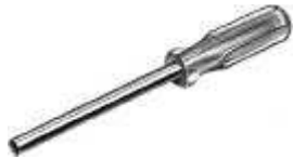
Nut Driver, Part No. 811262-1 (Used for assembling female screwlocks to connector flange)