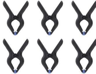
Large 6 Pieces Nylon Grip Clamps Set