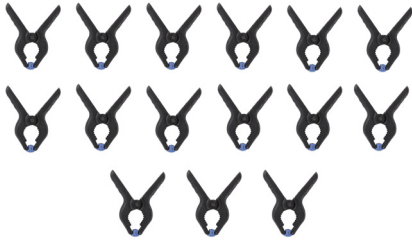
Small 15 Pieces Nylon Grip Clamps Set