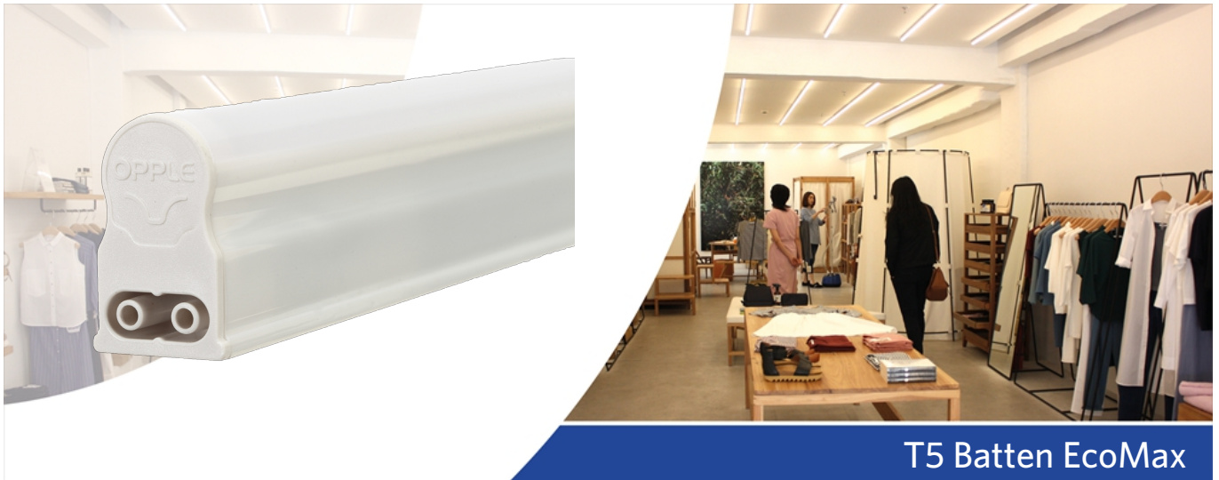
T5 Batten EcoMax