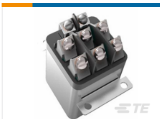
TE Part #1617807-5 FC-335-SY8= RELAY, 3PST