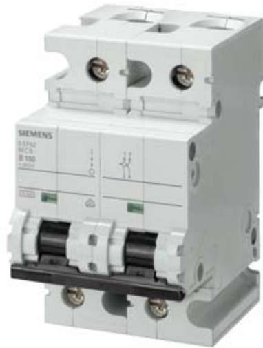
CIRCUIT BREAKER 400V 10KA, 2-POLE, B, 100A, D=70MM