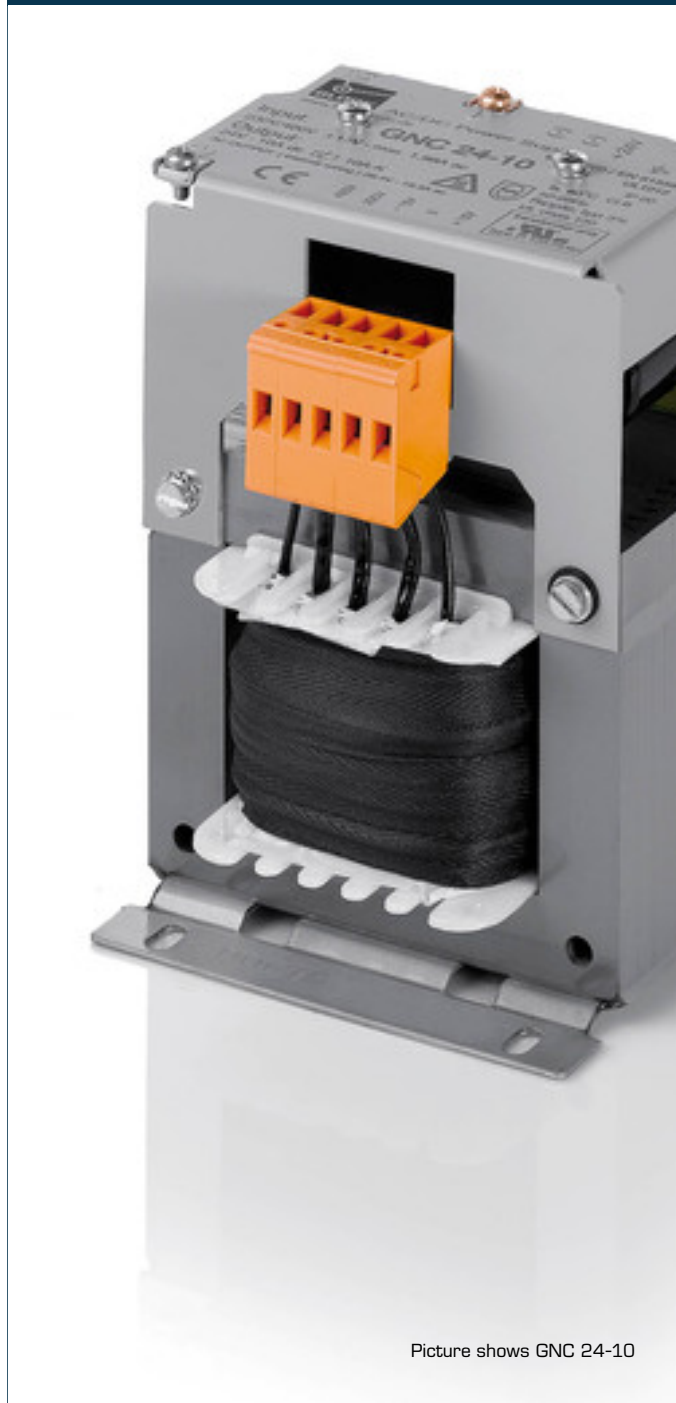
Picture shows GNC 24-10