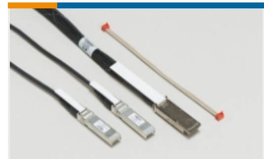
Pluggable I/O Cable Assemblies(18)