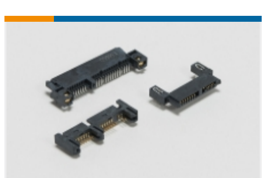
SATA & Micro SATA(1)