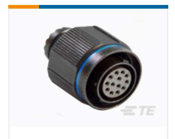
TE Part #YDTS26F15-05SNV001 PLUG ASSY