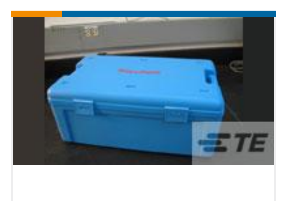
TE Part #CM8837-000 MINIRAY-GUN-CASE