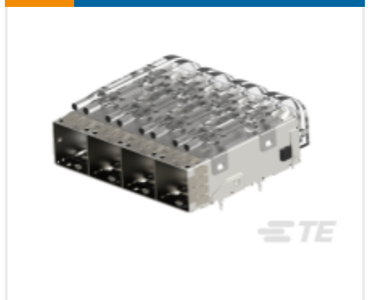
TE Part # CAT-MHD6907-C117 Mini-SAS HD Cages