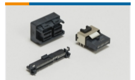
SAS & MiniSAS(10)