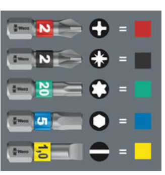
"Take it easy" tool finder with colour coding according to profiles and size stamp – for simple and rapid accessing of the required tool.