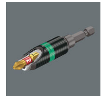
The BiTorsion holder and the BiTorsion bit can, of course, be used independently of one another.