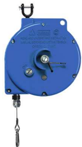
FLRC Model, Rear View