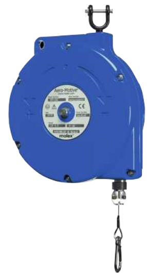
FLRC Model, Front View

General Industrial | Electrical Tools | Mechanical Tools | Pneumatic Tools | Cabling and Hoses