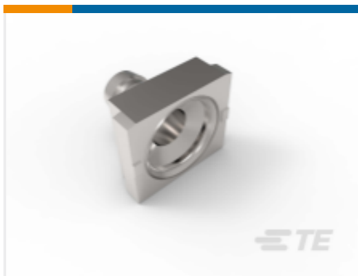
TE Part #2-2308348-3 CRIMP FLANGE 13 LARGE