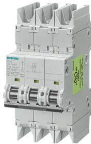
CIRCUIT BREAKER 10KA, 3POLE, D, 0.5A ACC. TO UL 489 - 480Y/277V