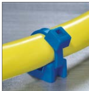
Fixing Tie Mount KR6G5-E/TFE.