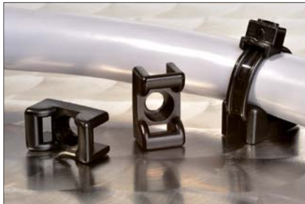
Cable Tie Mounts KR6G5, KR8G5 and CTM.