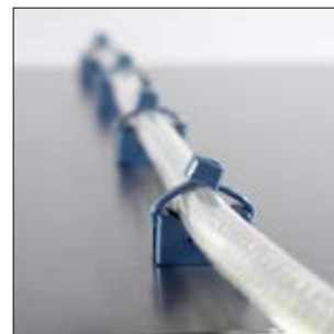
Detectable fixing solution containing of MCKR Mount and MCTS cable tie.