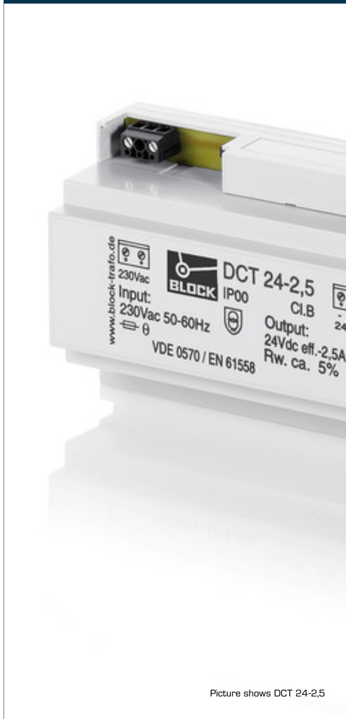
Picture shows DCT 24-2,5