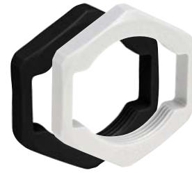
Type KGM: SUB-D9, PB, SUB-D25