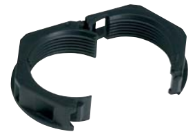
Type GMT: Split locknut