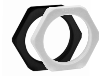
Type KGM: Standard nut, plastic