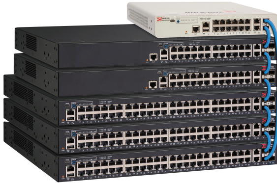
Figure 3. Up to eight Brocade ICX 7150 switches can be stacked together into a single logical switch using standard SFP+ 10 Gbps ports and copper cables or optics.