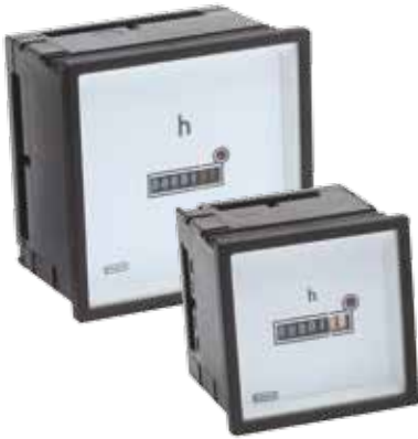
Elapsed Time/Hours Run Meters AC