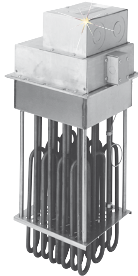
ADHT-005/480V/3P shown smaller than actual size.

Dirt/dust resistant terminal housing. Terminal housing made of solid heavy gauge aluminized steel rather than perforated metal to resist dirt and dust accumulation on the electrical connections and thus provide longer service life.