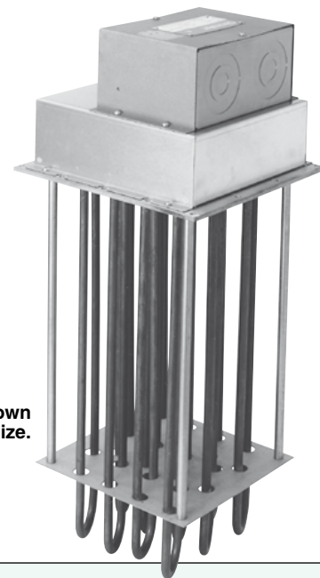
ADH-005/480V/3P shown smaller than actual size.