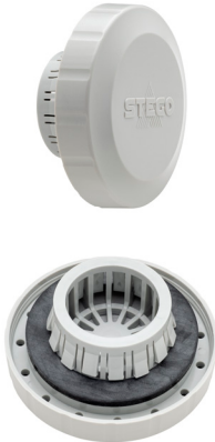
Photo: Inside view