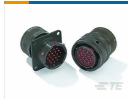
TE Part #ZPF00000000006773 951-06 RC 20-41 SW 50