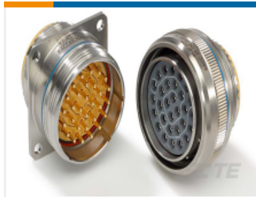
TE Part #ZPF00000000008022 983-1YE 08-03 P6