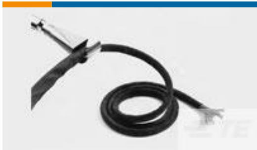
TE Part #CB03394012 RW-200-E-3/4-0-SP