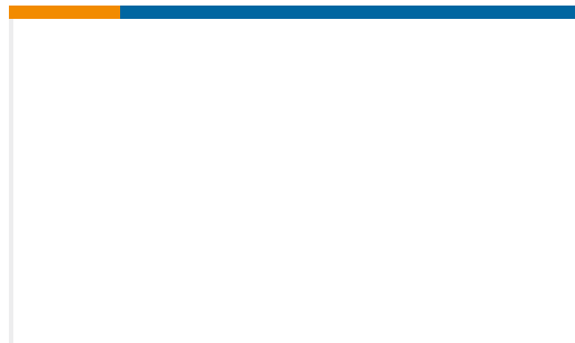
TE Part #CB03374008 RW-200-E-1/2-0-CS-34034