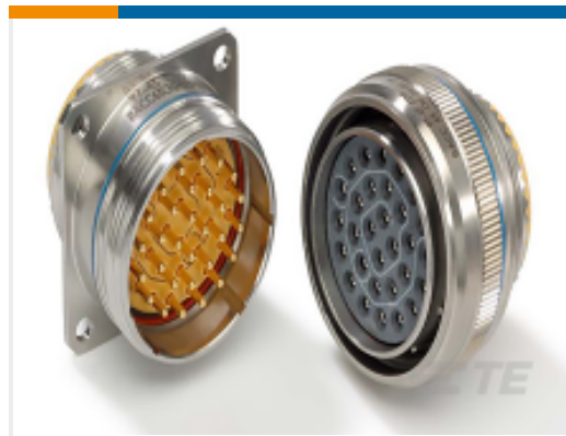
TE Part #ZPF00000000008024 983-1YE 08-03 P7