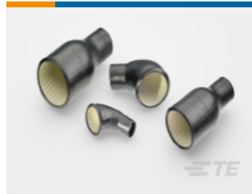
TE Part #EK7286-000 202S163-25C-0