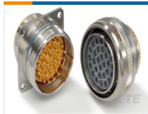
TE Part #ZPF00000000203365 983-1YE 10-06 PN-D1377