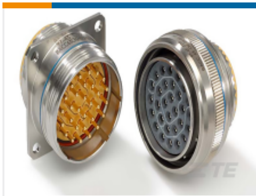
TE Part #ZPF00000000007997 983-1Y 08-03 P7