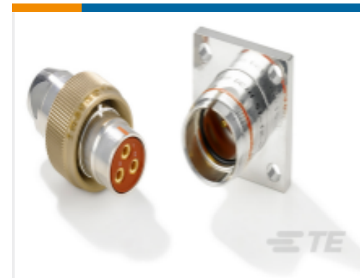
TE Part #ZPF00000000078858 DCI 20-3 S 1A