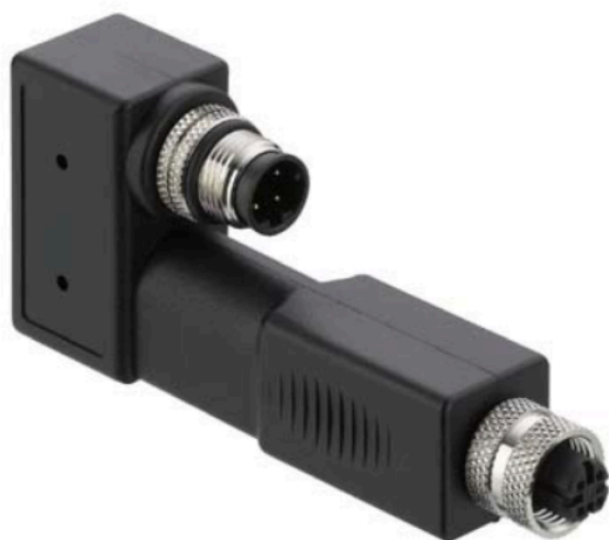
Part no.: 50134656 RSL400 M12 Adapter Adapter