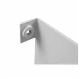
Internal weld nuts make for smooth, reliable assembly.